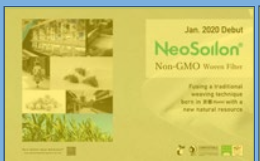
2 page Spread (full bleed) 426 x 283 mm.